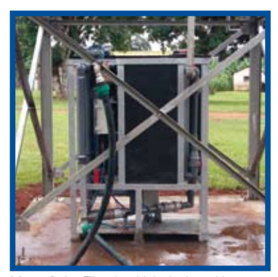
Mono Solar Filtration Unit designed in conjunction with GE.