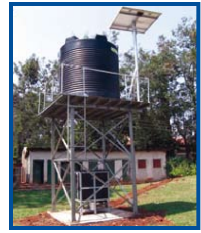
Water supply system at St Francis Hospital