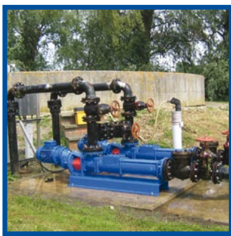
Transfer pumps at a WWTW's pumping sludge