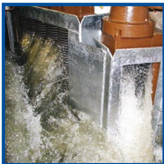
Discreen and Muncher screening and macerating waste water