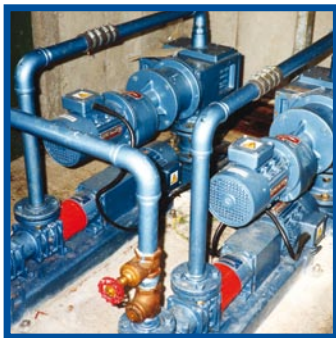
Packaged pumping system transferring raw sewage